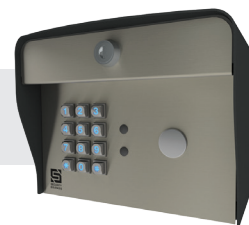
26-1000K Post Mount w/ Knox Cutout