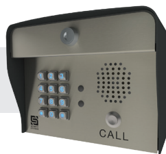
26-1000I Post Mount w/ Intercom