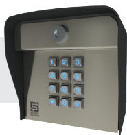
26-1000 Post Mount