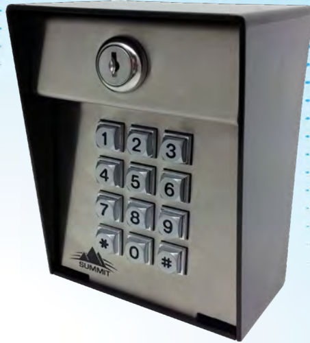
XL-660 Digital Access Control Station