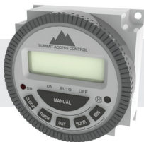
55-T12 12-VDC Timer