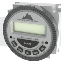
55-T24 24-VAC/DC Timer