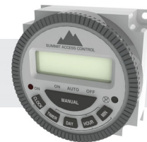
55-T110 110-VAC Timer