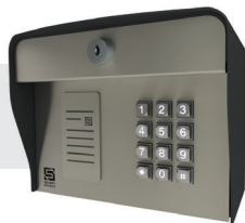
EDGE E1 Keypad 27-210