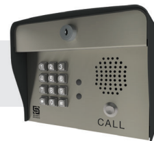
EDGE E1 + INTERCOM Keypad w/ Intercom 27-215