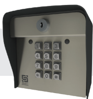
19-100 Post Mount