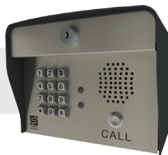
19-100I Post Mount w/ Intercom