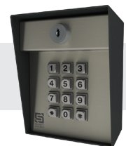
19-100E Post Mount Economy