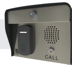
EDGE E2 SECUREPASS + INTERCOM Card Reader (SecurePass) w/ Intercom 27-225