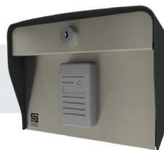
EDGE E2 HID Card Reader (HID) 27-220HID