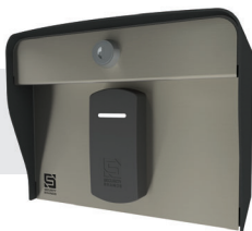
EDGE E2 SECUREPASS Card Reader (SecurePass) 27-220